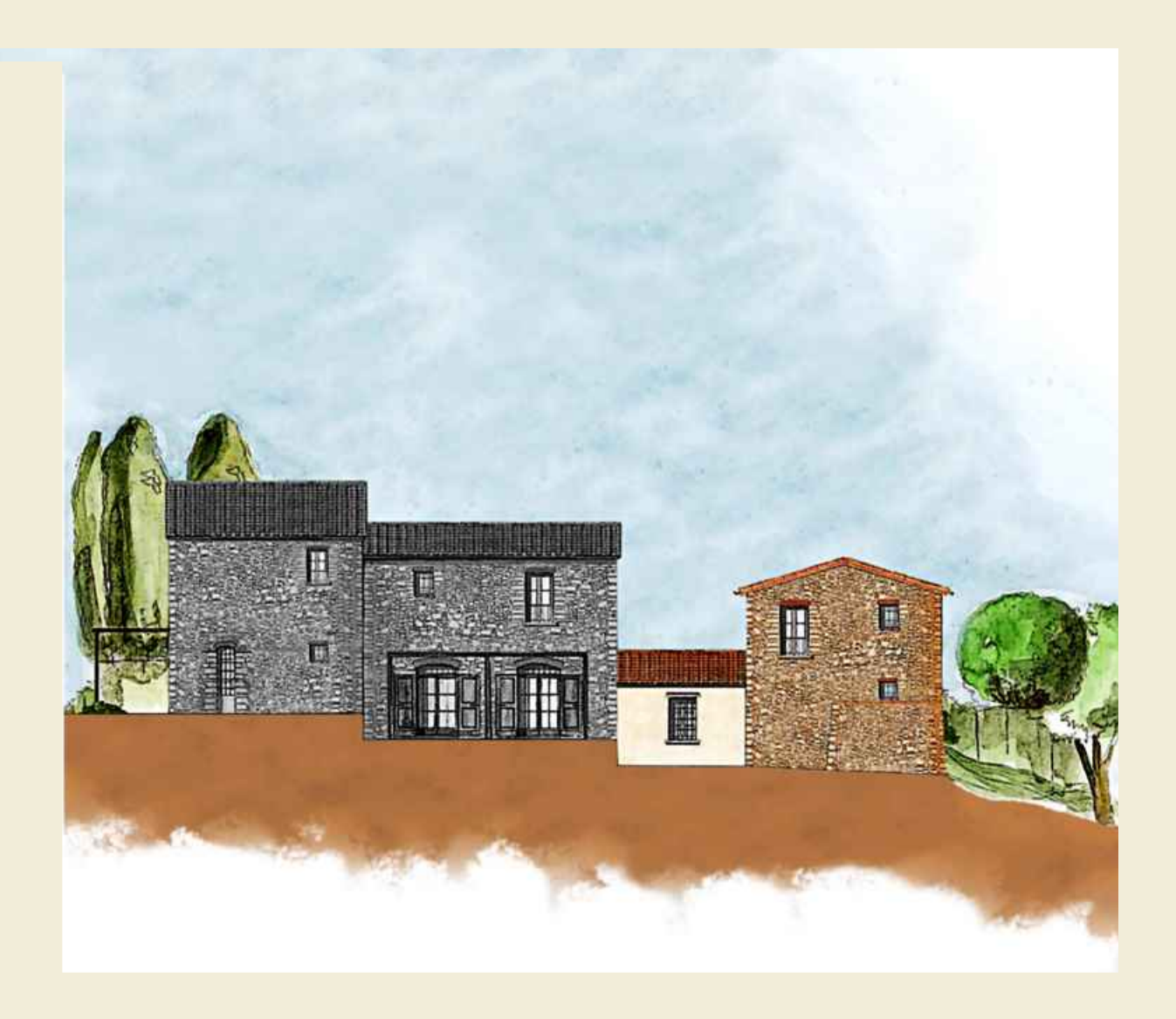
Casa di Sotto